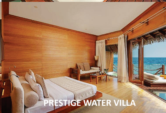
PRESTIGE WATER VILLA

The villa (91 m 2 ), wake to a mature house-reef shimmering beneath your deck. This teak-floored hideaway delivers laid-back exclusivity of a king bed, glass bottom floor and a private deck that spills into the lagoon.