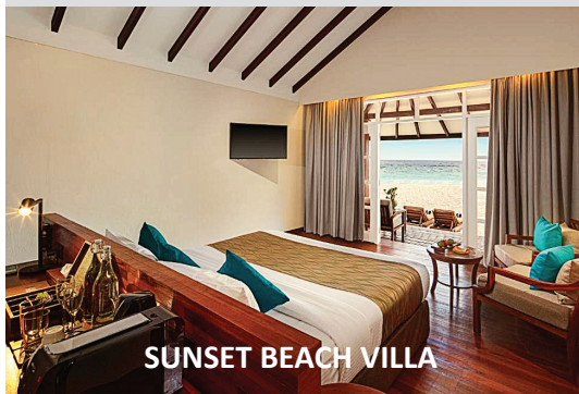
SUNSET BEACH VILLA